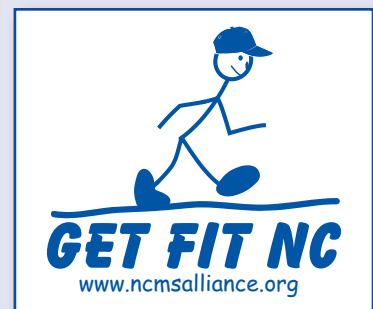
Get Fit NC 5K participants get ready for the race to begin.