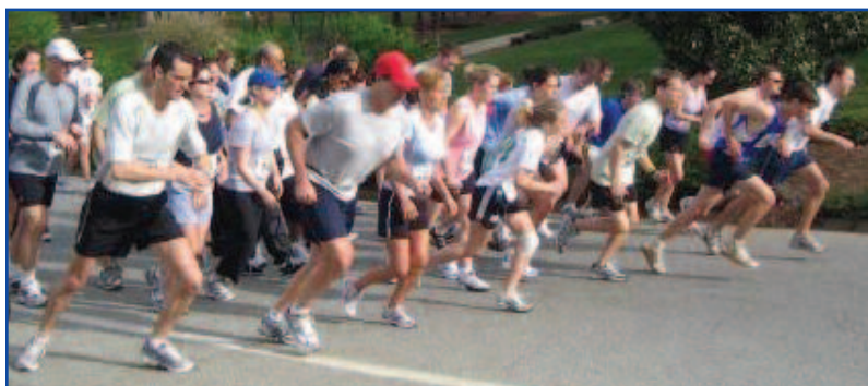
Supporters get moving in support of the Get Fit NC 5K.

Register today online at www.active.com or download a registration/donation form at www.getfitnc.org .