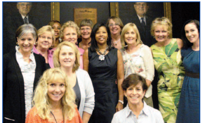
2011 NCMS Alliance Board of Directors at the August Board Meeting/Retreat in Raleigh