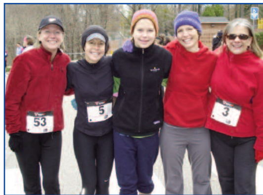
Participants from the 2010 Get Fit NC Race

Make plans to join the NCMS Alliance and walk, jog or run with physician families to help children develop healthy habits to last a lifetime. The Get Fit NC Road Race will take place on December 3, 2011 in Wake Forest, NC and this year is expanding to include a 10K, 5K and Kids' Fun Run.