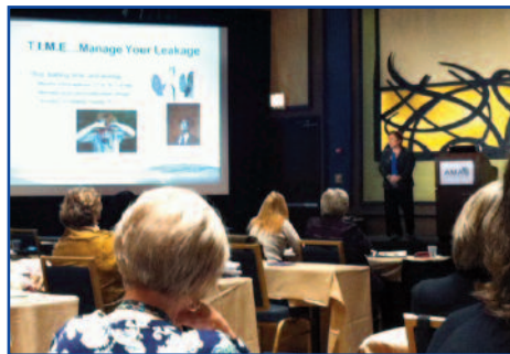
Presentation during the 2011 LDC focused on managing stress in the medical family.