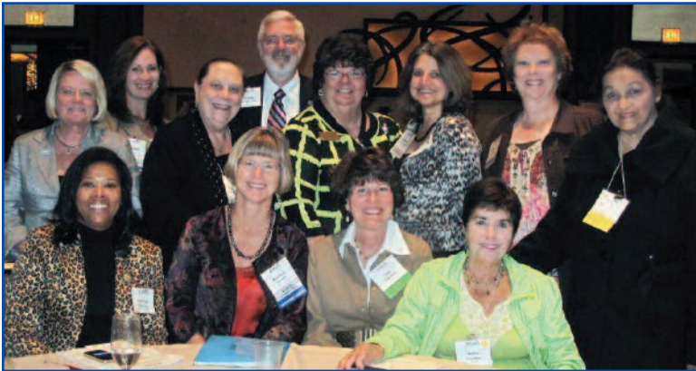
Alliance members from Arizona, Kentucky, Utah, Nebraska, California and North Carolina take part in a special roundtable session during the 2011 Leadership Development Conference.