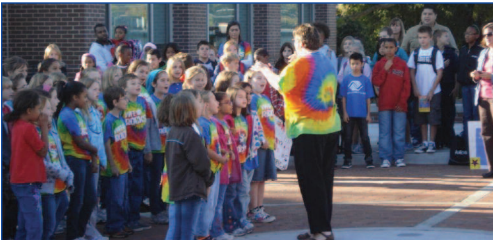
Wake Forest Elementary School Chorus delivers a song to celebrate the day.