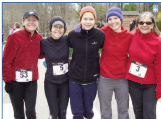
Participants from the 2010 Get Fit NC Race

Make plans to join the NCMS Alliance and walk, jog or run with physician families to help children develop healthy habits to last a lifetime. The Get Fit NC Road Race will take place on December 3, 2011 in Wake Forest, NC and this year is expanding to include a 10K, 5K and Kids' Fun Run.