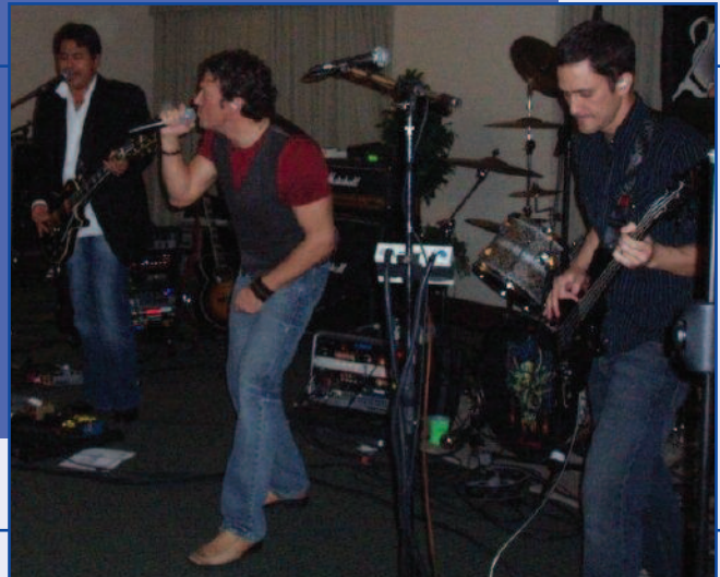
200 Joules from Charlotte.