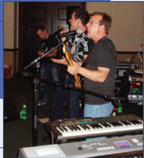
Skin Deep from Concord, NC.

Audio Ethics Production Services Cabarrus Family Medicine Carolinas HealthCare System Carolinas Medical Center – NorthEast Northeast Anesthesia and Pain Specialists. P.A.