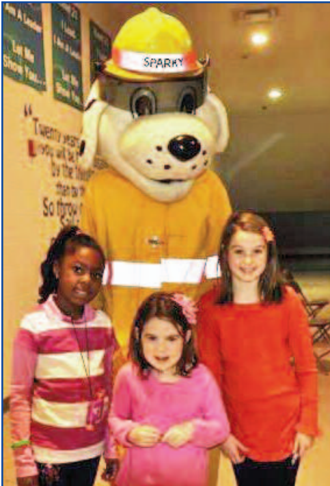
Sparky the Fire Dog teaches Health Fest participants about fire hazards and precautionary safety measures.