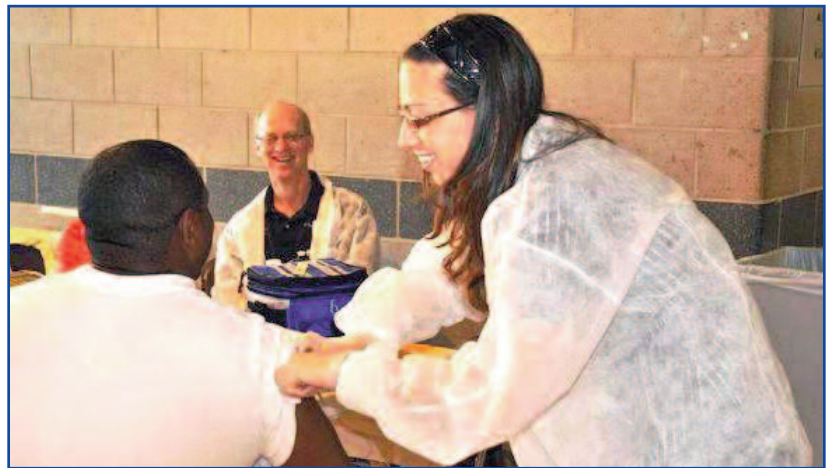
Area health care providers helped deliver a range of free screenings to participants.