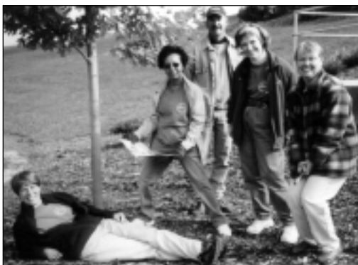
Haywood County Alliance members gather to beautify the grounds of Haywood Regional Medical Center in Clyde.